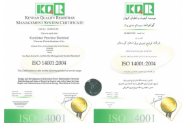
گواهینامه سیستم مدیریت ISO 14001-2004