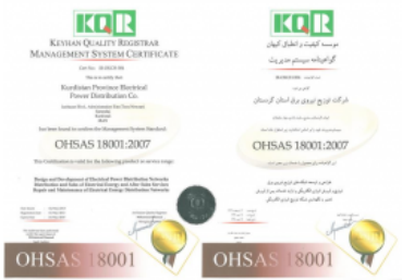
گواهینامه سیستم مدیریت ISO 18001-2007